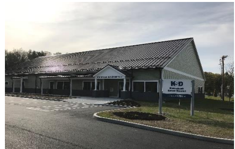
New administrative building at 44 Water St.

After a lot of planning and hard work, we have officially occupied our new administrative office! What an improvement over our old office space. The new administrative building is located at 44 Water Street, just up the street from our old office at the treatment facility. The new space features administrative offices, a conference/multipurpose room, an engineering layout room, mailing and printing room, records room, training room, locker rooms, and a maintenance garage. Stop by for a tour of the new space. Our office hours are 7:00-4:00 (Monday. – Thursday) and 7:00-12:30 (Friday).